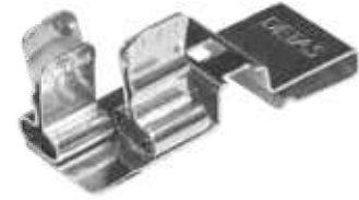
MSRP 1.5-3 V2