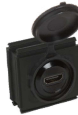
SPG W22 HDMI