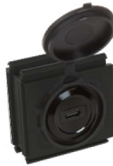
SPG W22 USB-C