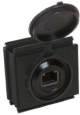
SPG W22 RJ45 Cat.6