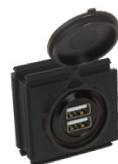
SPG W22 2xUSB 2.0