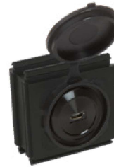
SPG W22 USB-Micro