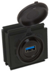
SPG W22 USB 3.0