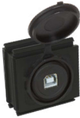
SPG W22 USB-B