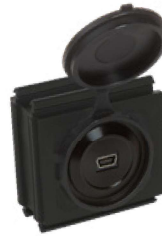
SPG W22 USB-Mini