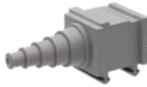
SPP PG T